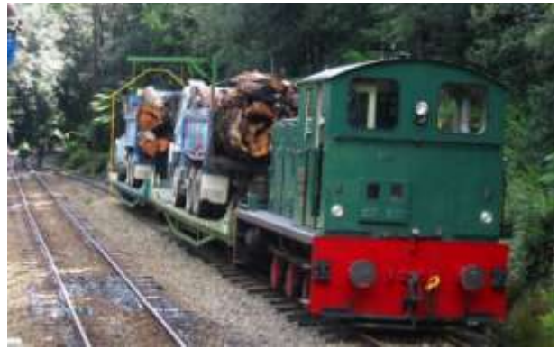
Figure 15 Loaded trucks on wagons checking clearance through yellow clearance frame and restored Drewry locomotive (Cooper)